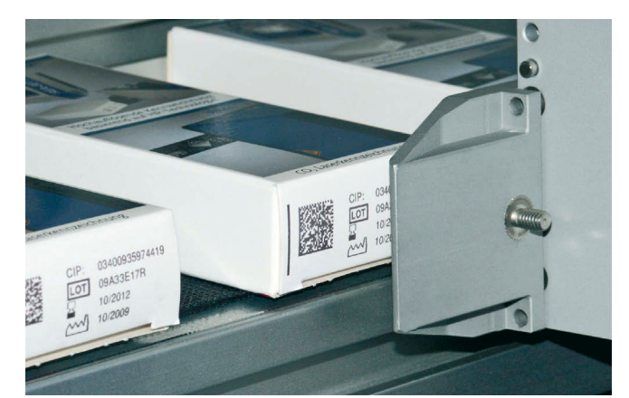
Cardboard box coding using DataMatrix code