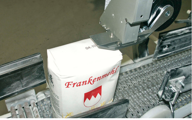
Marking of flour bags