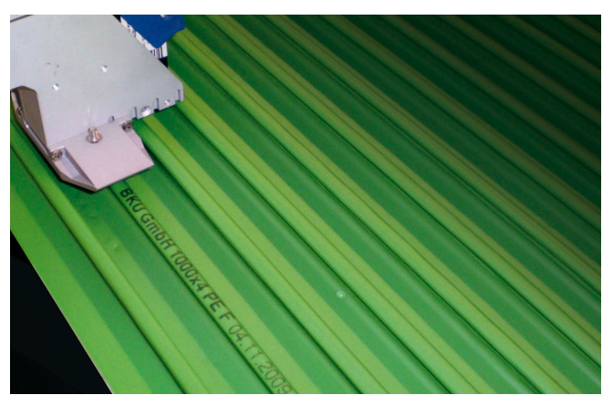
Coding of plastic profile plates